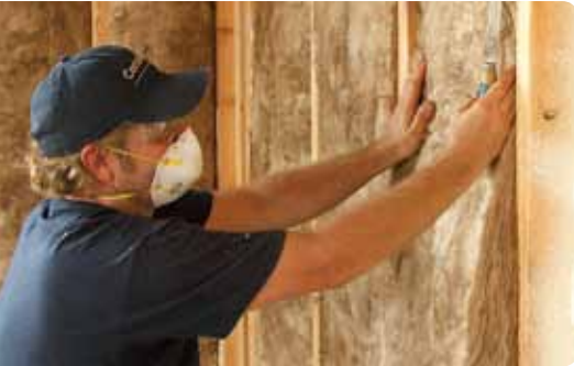
Residential Sustainable Insulation®

For every insulation challenge, there's a CertainTeed solution.