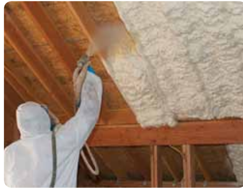
Spray Foam Insulation