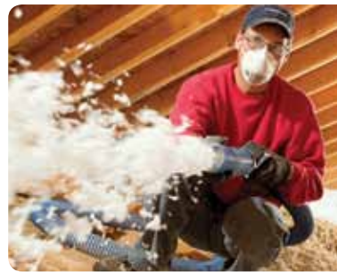
Premium Blow-in Insulation