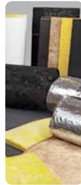
HVAC / Mechanical