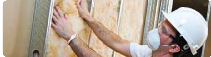
CertaPro™ Commercial Insulation